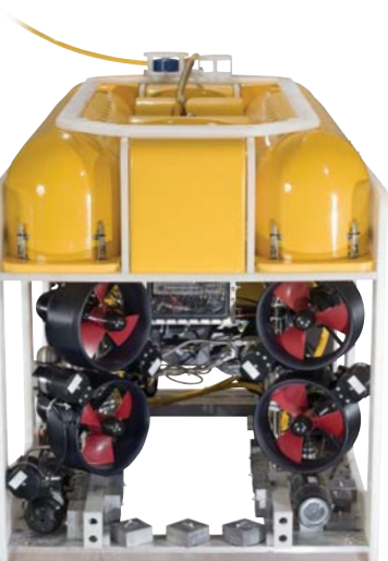
PANTHER-XT PLUS SHOWING TOOL SLEDGE COMPARTMENT